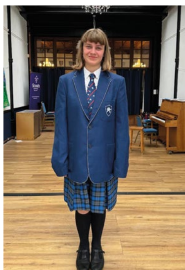
❖ Winter Uniform