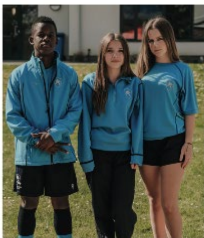
P.E Kit - Front

Swimming kit should be brought into school throughout the school year.