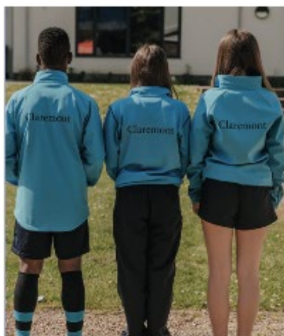
P.E Kit - Back