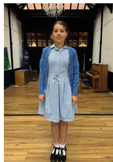
Summer Uniform ❖